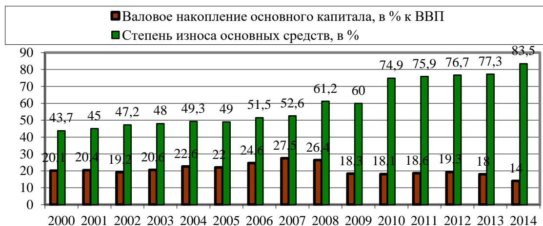
Figure 1. Gross Fixed Capital Formation in % to GDP and the Degree of Depreciation of Fixed Assets in 2000-2013 7

Figure 1 is a proof of the fact that the capital-labor ratio may grow under the terms and conditions of the scientific and technological involution (reducing the rate of accumulation, degradation of fixed capital).