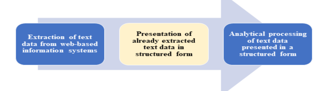
Figure 1. Extraction, presentation in a structured form and analytical processing of text data in web-based information systems

• The conceptual approach does not imply the inclusion of methods related to analytical processing of text data already presented in a structured form. Analytical processing is the subject of further research outside the scope of this article. In essence, analytical processing may include performing contextual analysis, analysis of specific fragments of the text, etc.